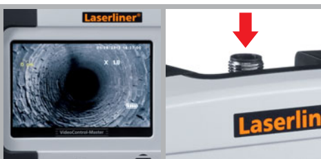
5.0" TFT colour display